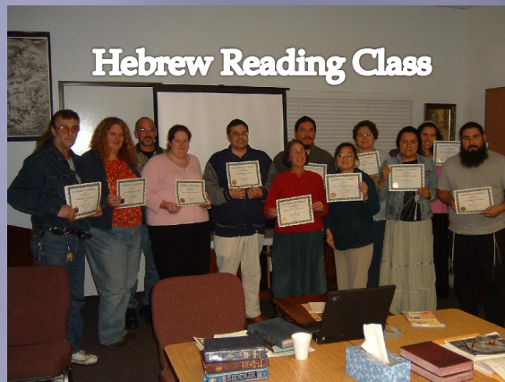
Hebrew Reading Class