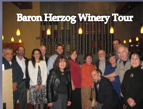
Baron Herzog Winery Tour