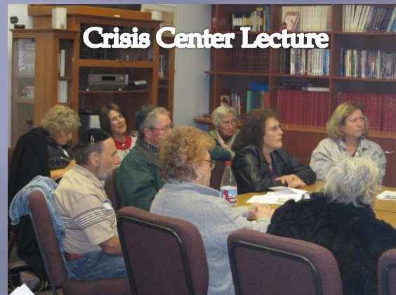
Crisis Center Lecture