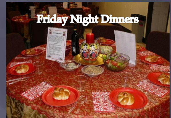
Friday Night Dinners