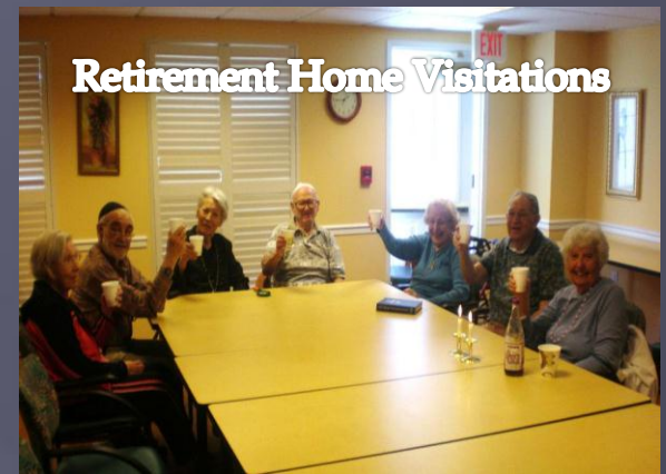
Retirement Home Visitations